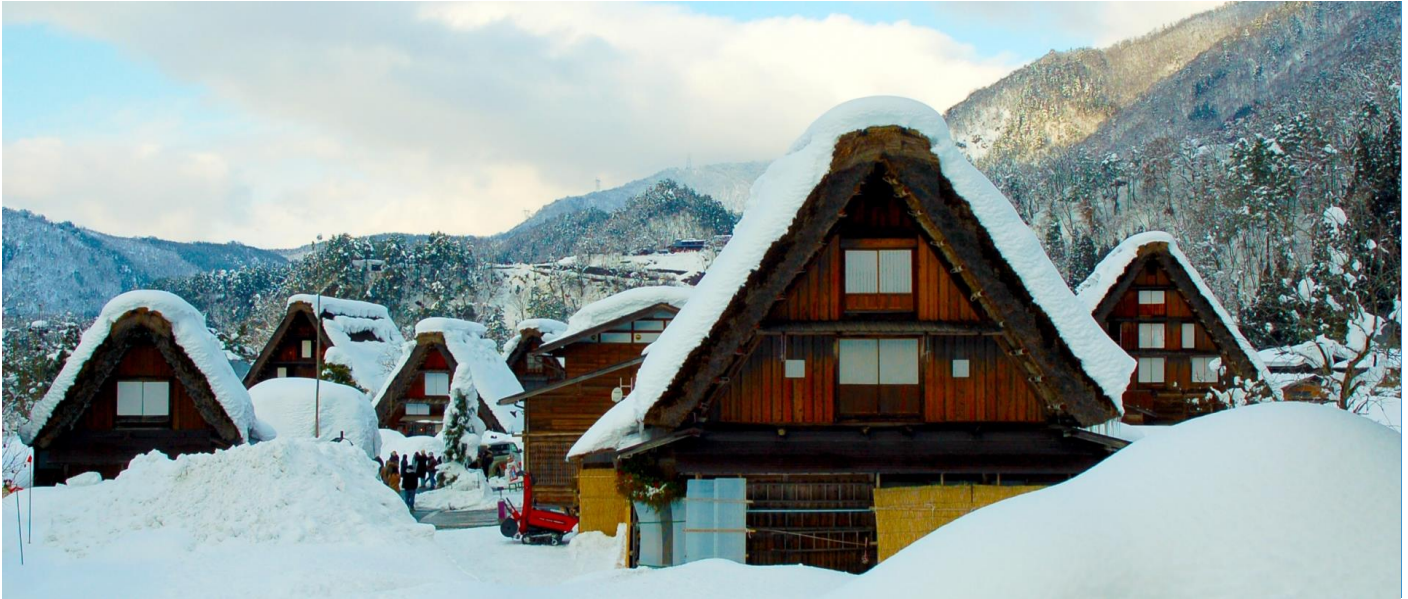
Winter in Shirakawa-go: Snowy Landscape