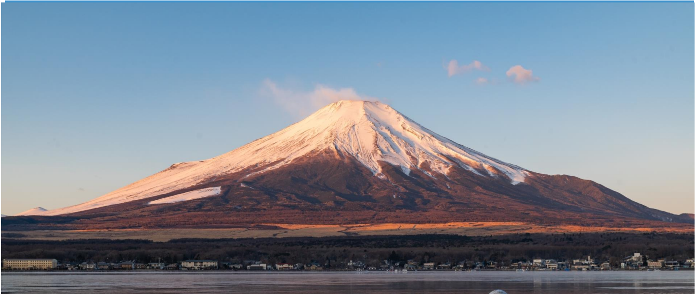
Mount Fuji in Winter