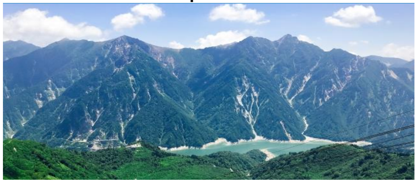
A View from Murodo in Toyama Prefecture