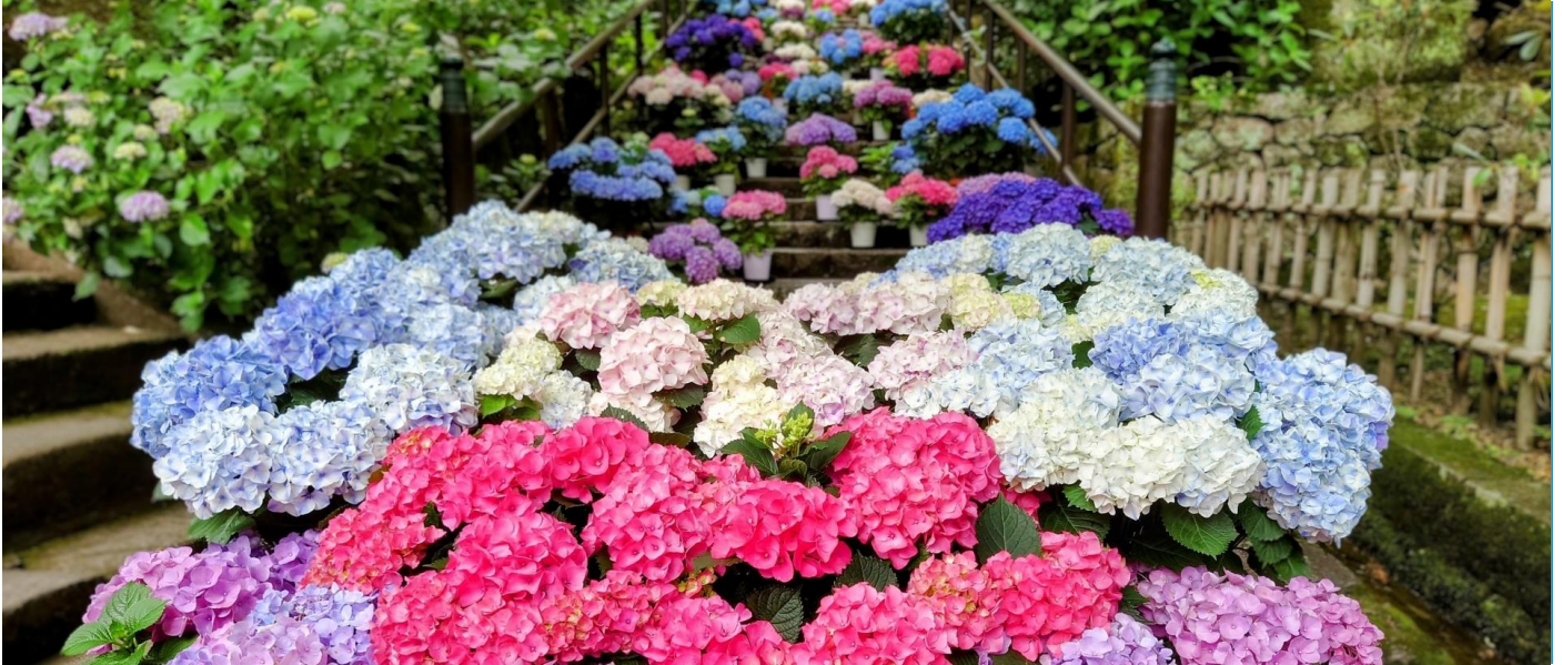
Hydrangeas from Hase temple in Kanagawa prefecture