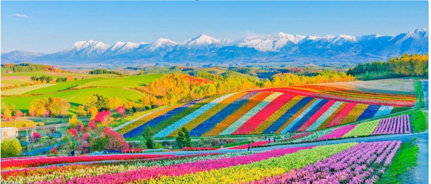
Hokkaido Biei's Panoramic Flower Gardens - Shikisai no Oka