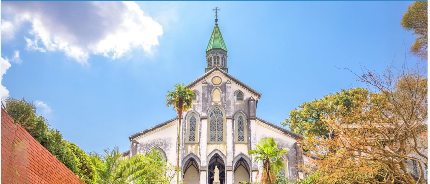
Ōura Church in Nagasaki Prefecture