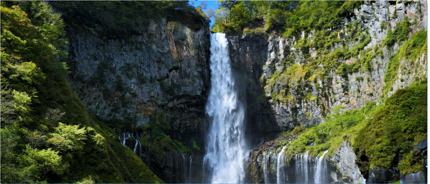
Kegon Fall in Tochigi Prefecture