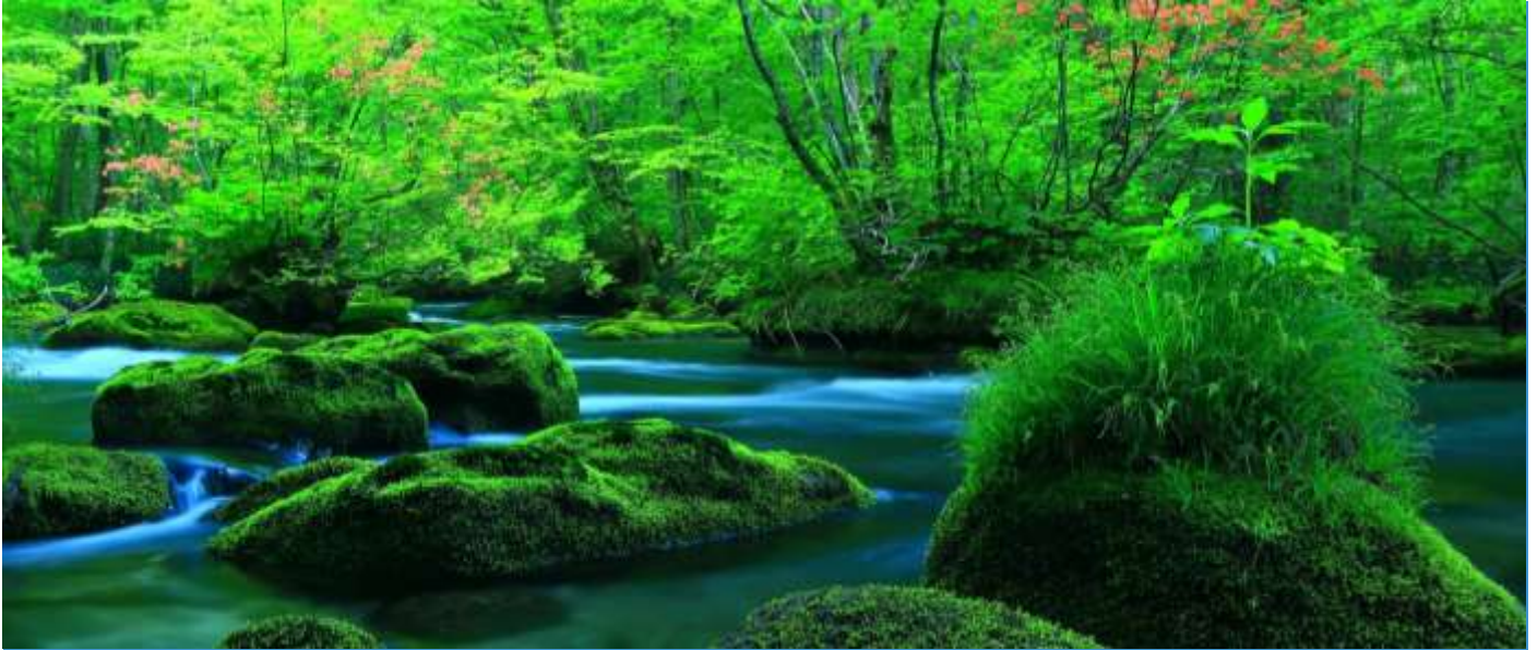
Oirase Gorge in Aomori Prefecture