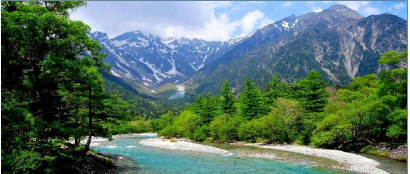
amikouchi area in Nagano prefecture