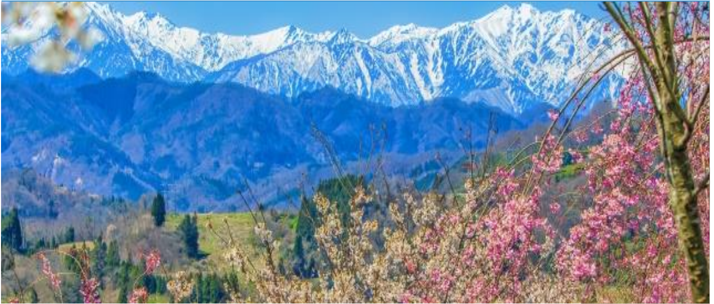
Spring scenery in Nagano Prefecture