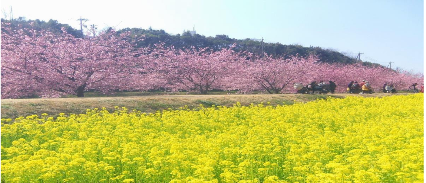
Cherry blossoms in Hamamatsu, Shizuoka